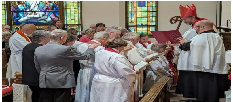
Laying on of hands